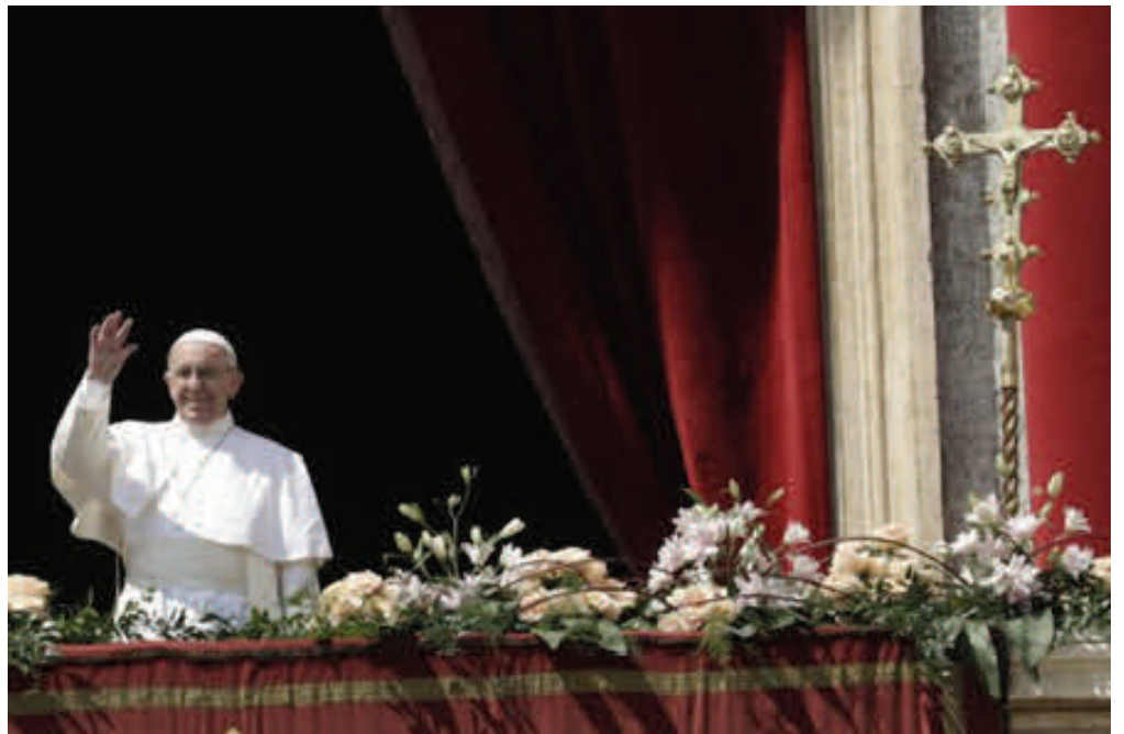
Pope Francis waves prior to delivering his Urbi et Orbi (to the city and to the world) message, from the main balcony of St. Peter's Basilica at the Vatican, Sunday, April 16, 2017.

Closing his homily, Francis called upon those present to think about the every-day problems of life, illnesses, wars, human tragedies and say, "with a humble voice, without flowers, alone, to God who's in front of us: 'I don't know how this is going, but I'm sure that Christ has risen.'"