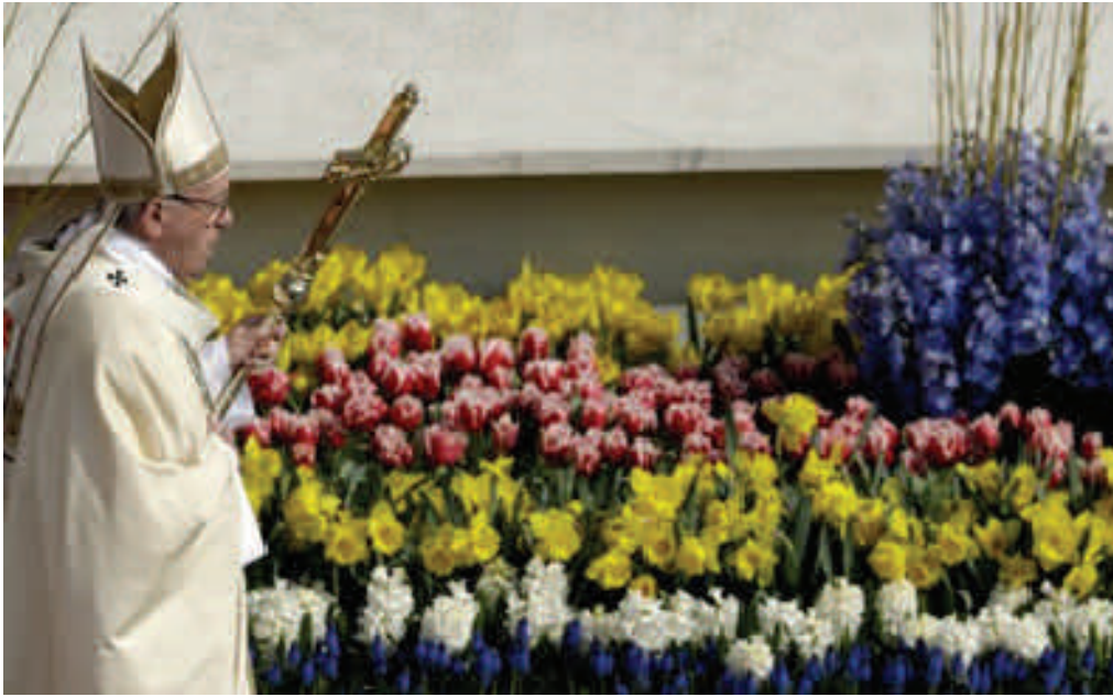
Pope Francis celebrates the Easter Mass, in St. Peter's Square, at the Vatican, Sunday, April 16, 2017.

do these things happen, so many tragedies: illnesses, human trafficking, human exploitation, wars, destruction, mutilations, vengeance, hatred?" "Where is the Lord?" he asked aloud.